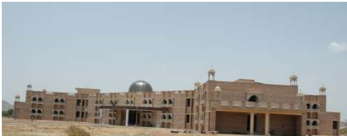
Lab NRCSS, Tabiji, Ajmer

CPWD has completed construction of a double storied laboratory cum administrative block for the NRCSS at Ajmer. The building having a plinth area of 3152 sqm has 15 laboratories, offices and a conference room. The building has been designed keeping in view traditional Rajasthani Architecture.