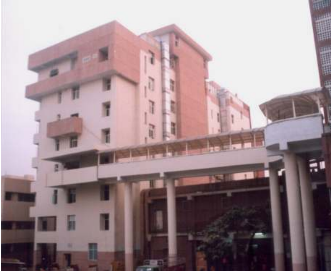
CN Tower built for AIIMS, New Delhi