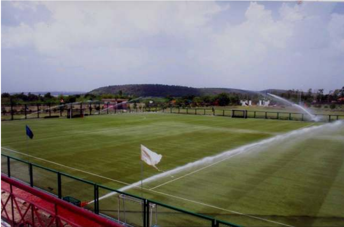
Hockey field for SAI Bhopal