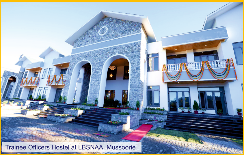
Trainee Officers Hostel at LBSNAA, Mussoorie