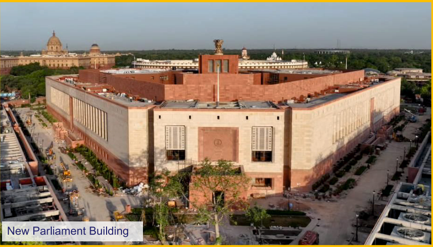
New Parliament Building